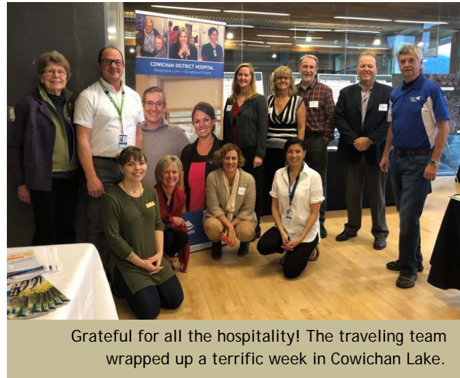
Grateful for all the hospitality! The traveling team wrapped up a terrific week in Cowichan Lake.